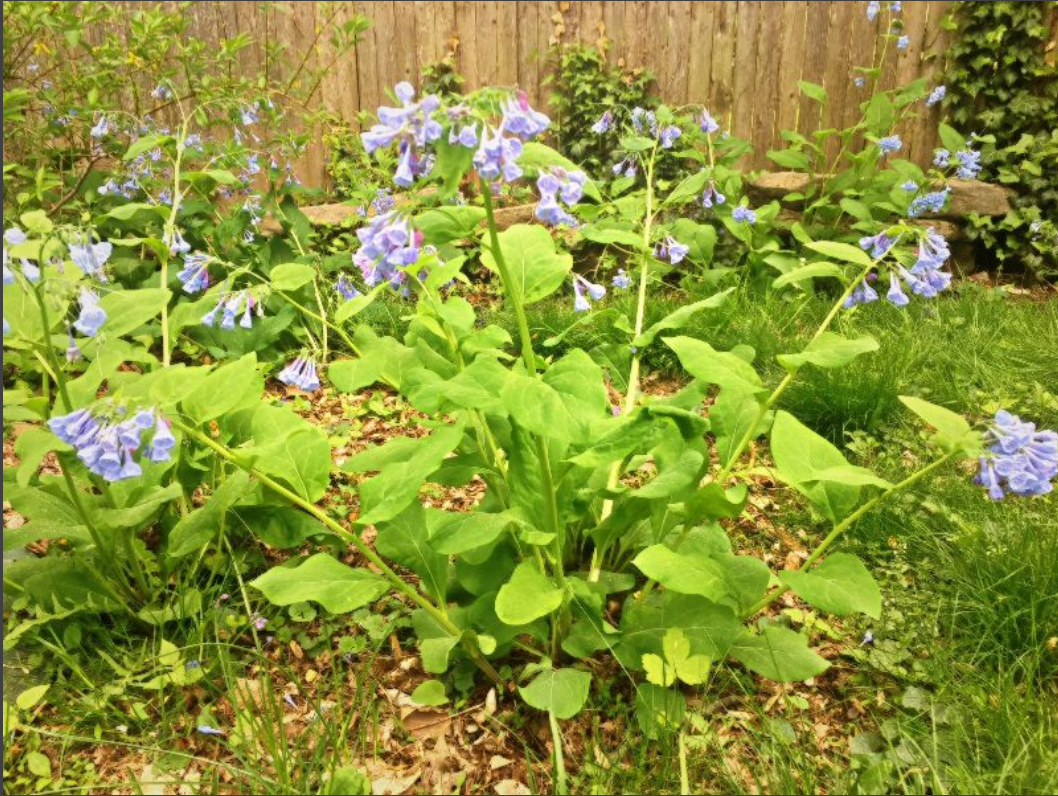
Mertensia virginica , spotted in Chestnut Hill in early May

maintenance spring-bloomers. Best planted with other perennials or annuals that bloom in summer, as that's when Bluebells go dormant.